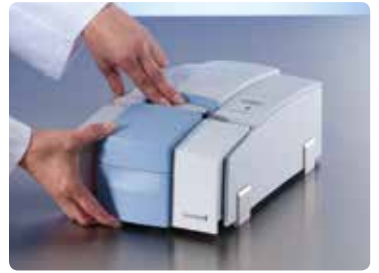
QuickSnap™ module exchange

The diffuse reflection (DRIFT) module is a very suitable option for the analysis of a broad variety of solid samples: powders, inorganic material, gem stones and many others. The DRIFT module is designed for easy sampling and high light throughput. This results in an unmatched time-per-analysis for FTIR diffuse reflection measurements.